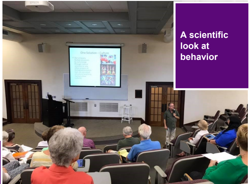
A scientific look at behavior