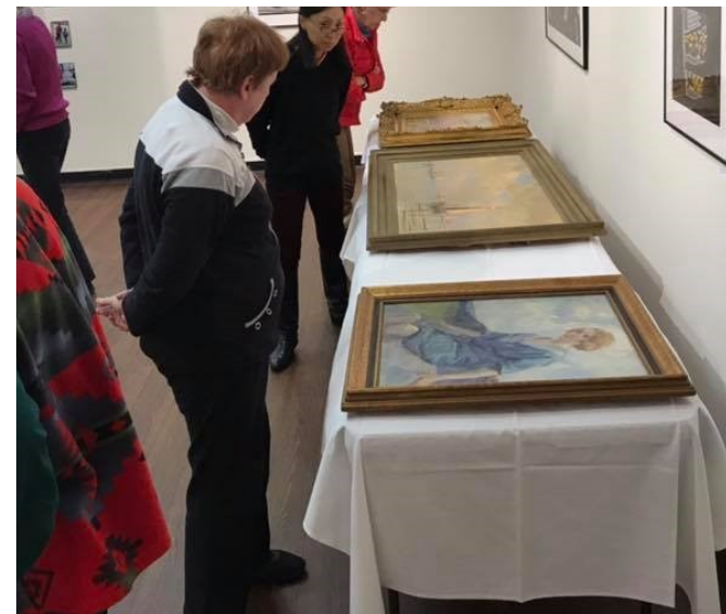
Exploring Impressionism in Wesleyan Art Collection

Don't forget that Wesleyan art galleries are open Monday-Friday from 1:30 - 5:00 PM and the Wesleyan Market is every 2nd Saturday from 10:00 AM - 2:00 PM