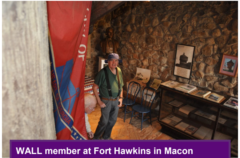
WALL member at Fort Hawkins in Macon