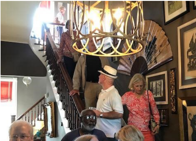
Touring Macon Homes is always popular with WALL students

Wesleyan College offers so much to our WALL members and to the community at large. Many events on campus are open to the public (most are free of charge).