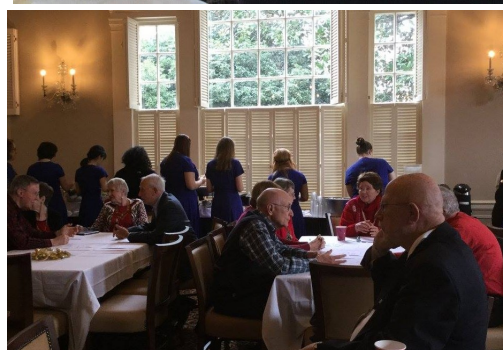
The WALL Holiday Luncheon was full of good cheer (and gifts).